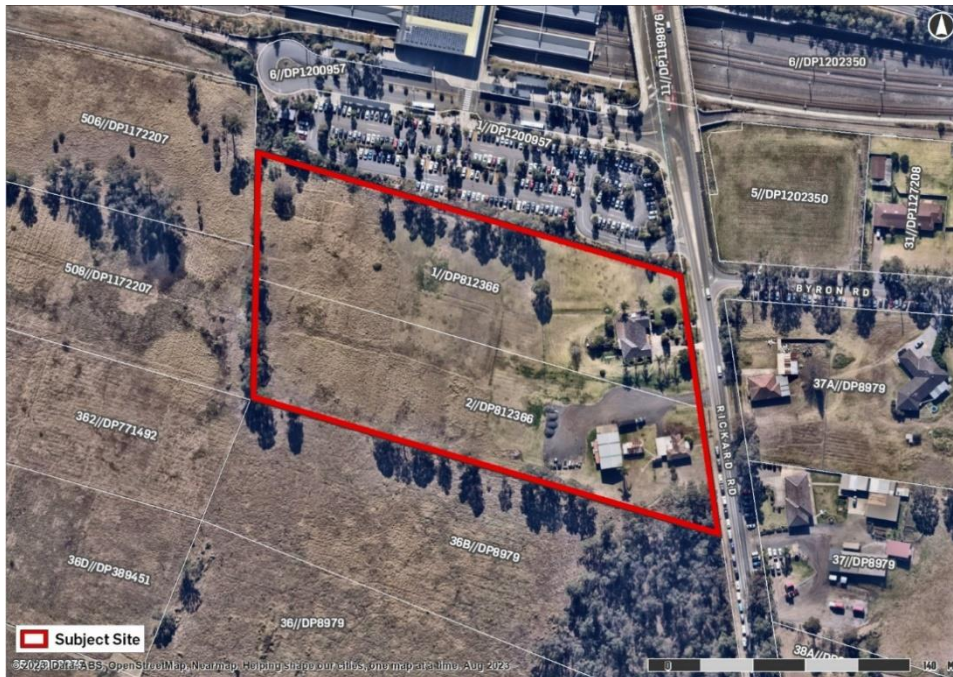
Figure 1 Site Aerial

The land to which this proposal relates is 173-183 Rickard Road, Leppington, with a total site area of 3.2ha. The site is accessed via Rickard Road and is located within the Leppington Town Centre which extends across both the Camden and Liverpool LGAs. The site, however, is located entirely within the Camden LGA portion of the town centre. The site is more broadly situated in the SWGA.